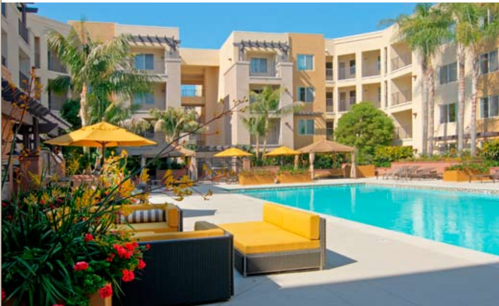
40069